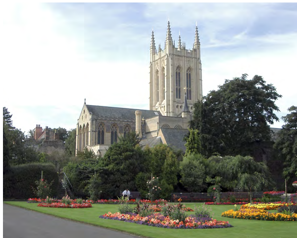
ST EDMUNDSBURY CATHEDRAL FROM THE ABBEY GARDENS