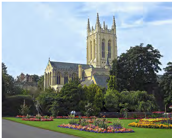
ST EDMUNDSBURY CATHEDRAL FROM THE ABBEY GARDENS